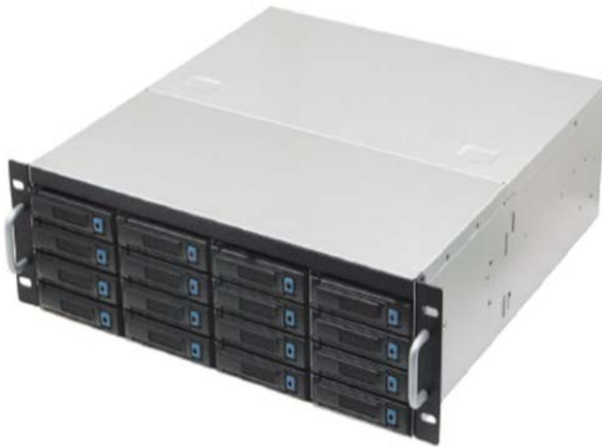
Top Open Angle