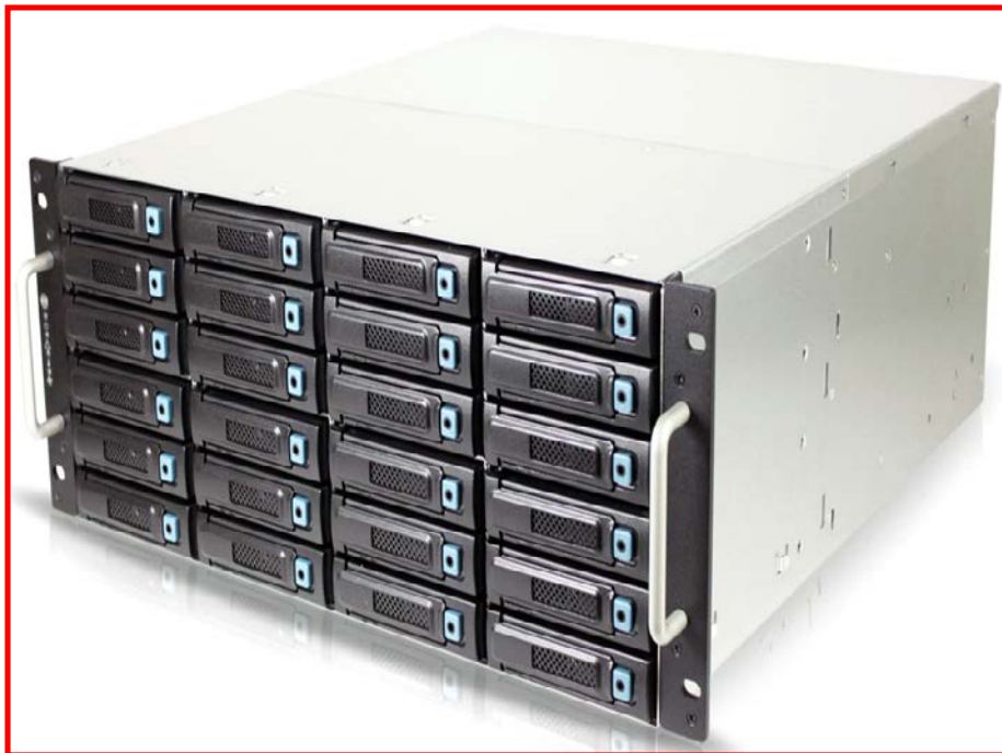
Top Open Angle